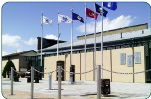
Clearwater County Veterans Memorial