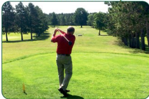
Twin Pines Golf Course

Public 9-hole course - Tee times not required